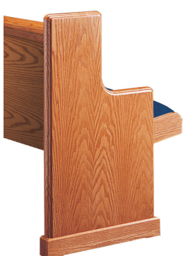
Bench End 302-4109