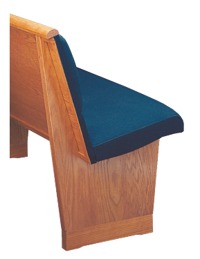
Bench End 302-2200