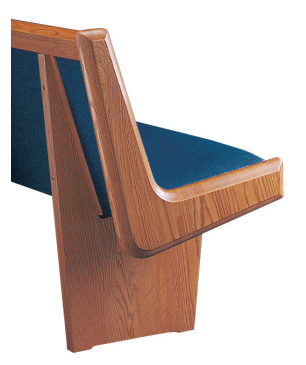
Bench End 302-2085