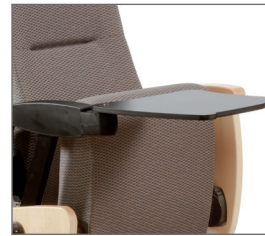
Left or Right Tablet Arm One per chair, select side