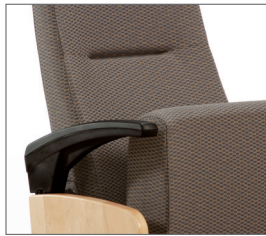
Poly Fixed or Flip-up