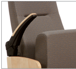
Wood Fixed or Flip-up