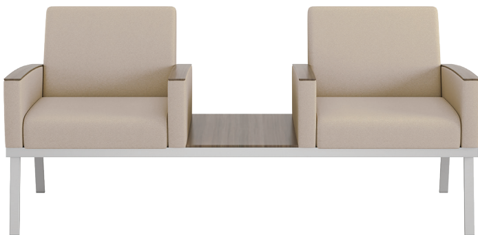
10312CT 2 Seat, Center Table